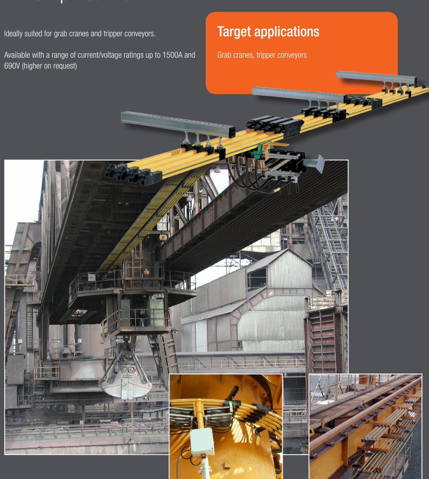
Conductor Rails on a boom stacker