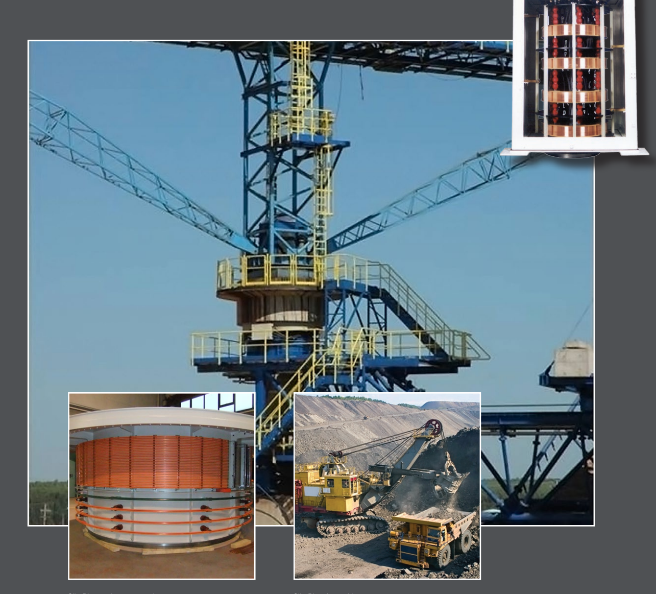
Slip Ring under construction 2200 mm Inner diameter, 4200 mm outer diameter

Circular stacker/reclaimers, slewing stackers, bucket wheel excavators